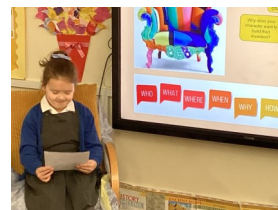
Children sharing their story plan with their class.